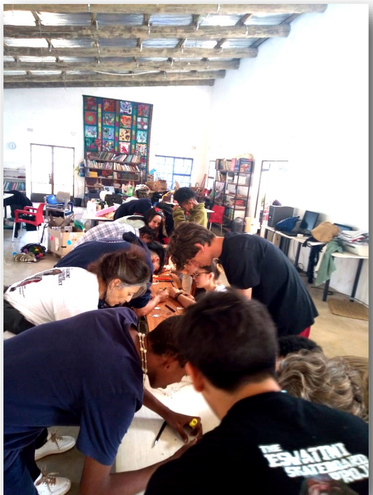
Art collaboration with the Italian volunteers in July

This means that adolescents require support and direction from their parents, classmates and guides. They also need to become self dependent and all of this requires a degree of freedom. Freedom in a Montessori environment means freedom within limits. A common misunderstanding of this type of education is that it is undisciplined and without structure. On the contrary, a Montessori classroom may appear to be a bit chaotic but it is very structured and carefully designed to facilitate peer-to-peer learning, communication and interaction with learning materials. There is freedom of movement, but this must involve respect, respect for the environment and for others. Freedom in an adolescent programme essentially focuses on the freedom of choice. Students are able to self direct their learning process through choice of inquiry in their study guides.